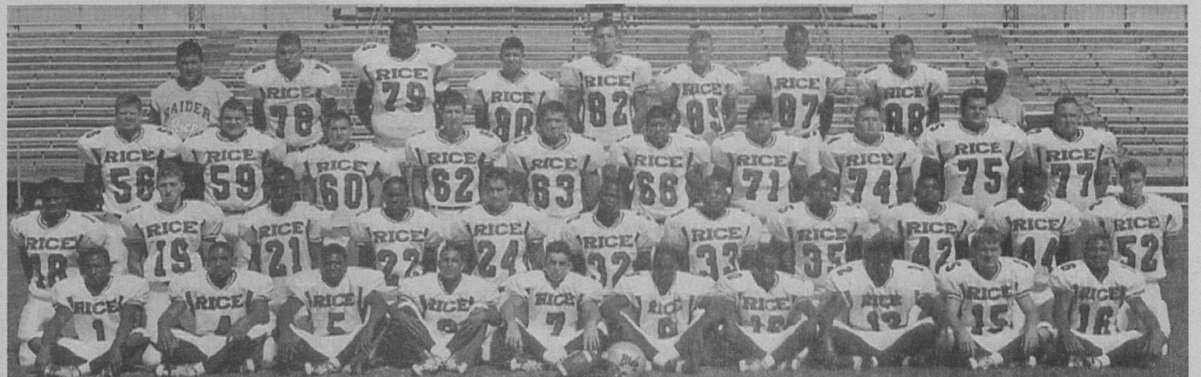
2002 Rice Varsity football team